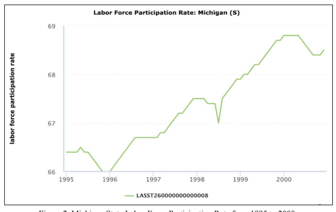
Figure 2. Michigan State Labor Force Participation Rate from 1995 to 2000.